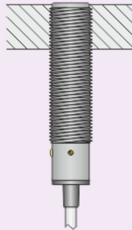
Montaggio a filo